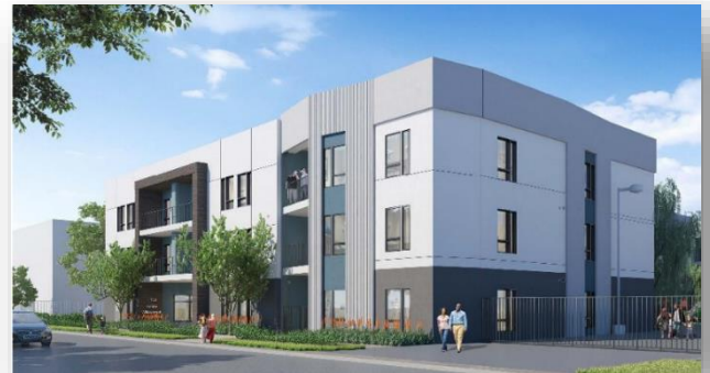
Ashley Willowbrook has 37 PSH units designated for low-income households experiencing homelessness. Out of the available units, 27 are designated for Transitional Aged Youth (18-24) and 10 for families.

"CRCD came into our lives and turned it all around for us. Now [that] we are home, we can finally breathe again..." Resident at The Residences on Main